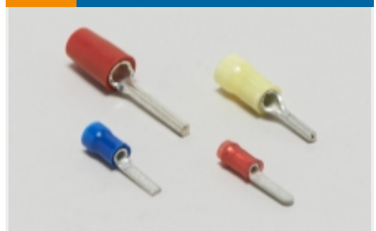
Crimp Wire Pins, Tabs & Ferrules(25)